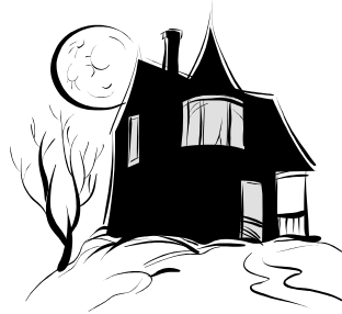
Make your yard the spookiest!

Prizes: For each contest, First place will receive a $50 Lowe's gift certificate, Second place will receive a $25 Lowe's gift certificate, and Third place will receive a $10 Lowe's gift certificate.